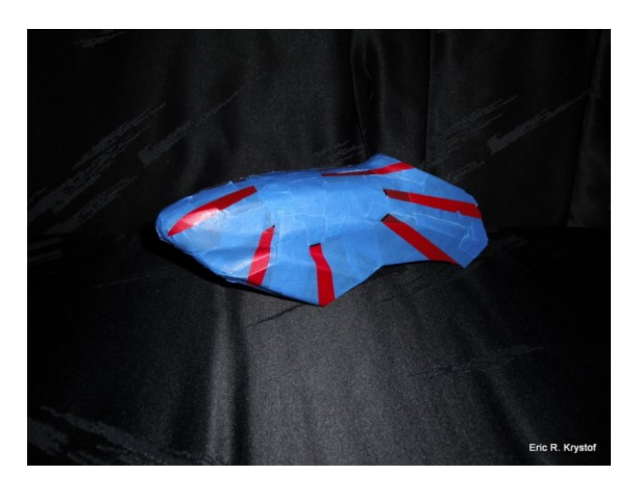
Taped up Spidey Canopy... Almost ready.