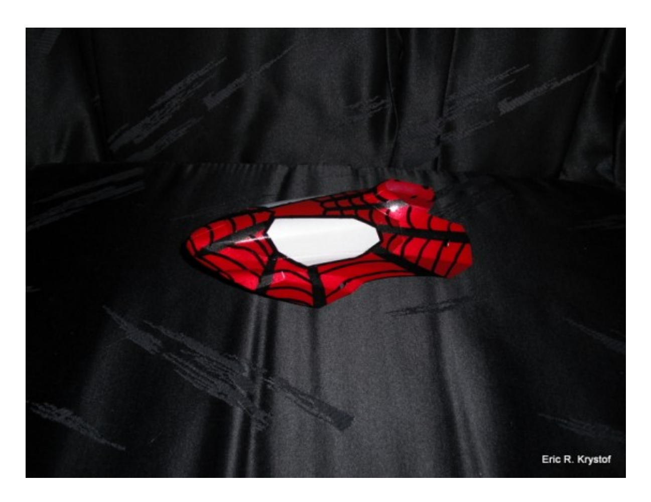
Final shot of Spidey-Canopy