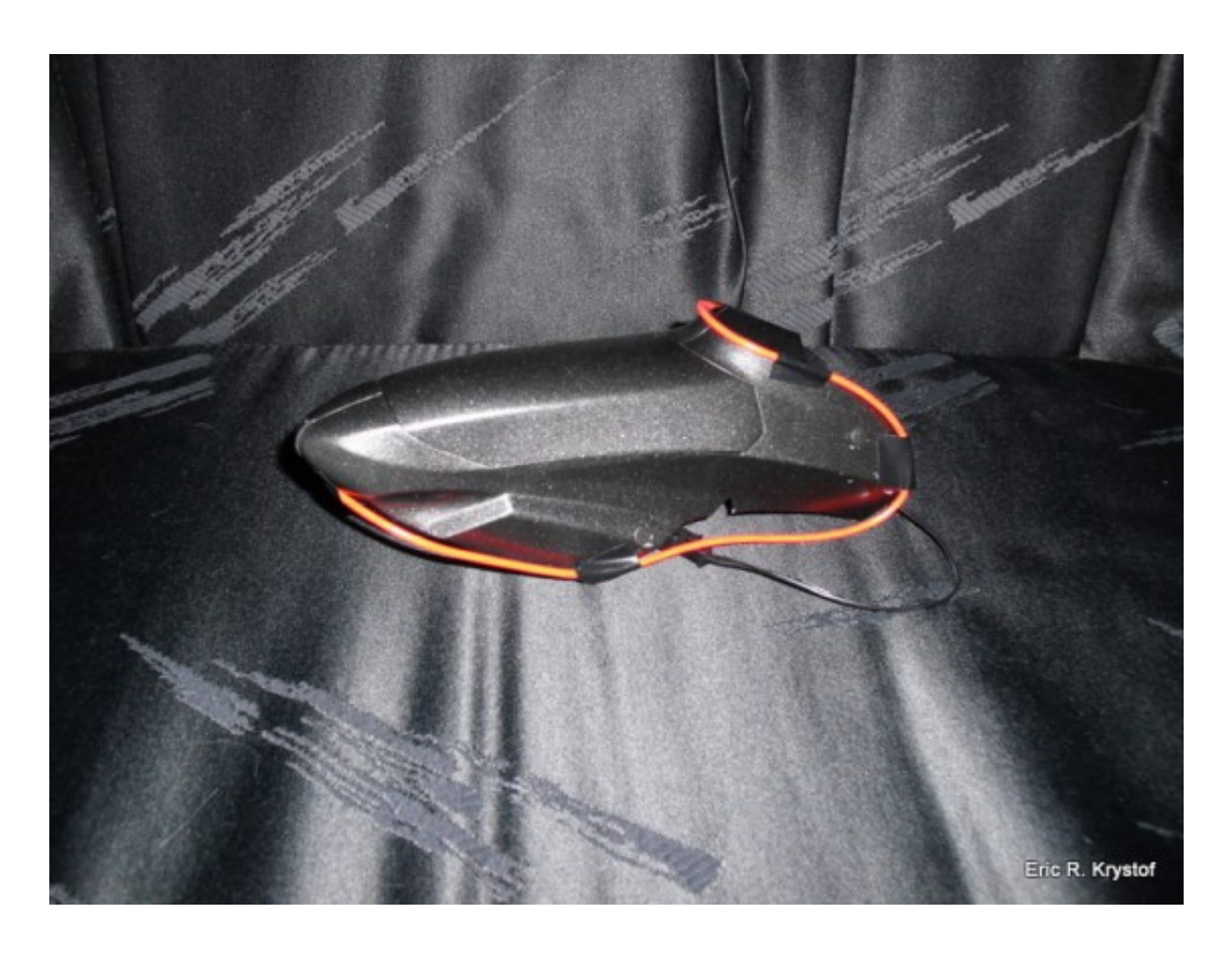
Black canopy with EL Wire for Night Flying

When I was growing up, I was, as most kids, into comic books. One book in particular. Spider-man . After painting the last two canopies, I wanted to personally kick it up a notch.