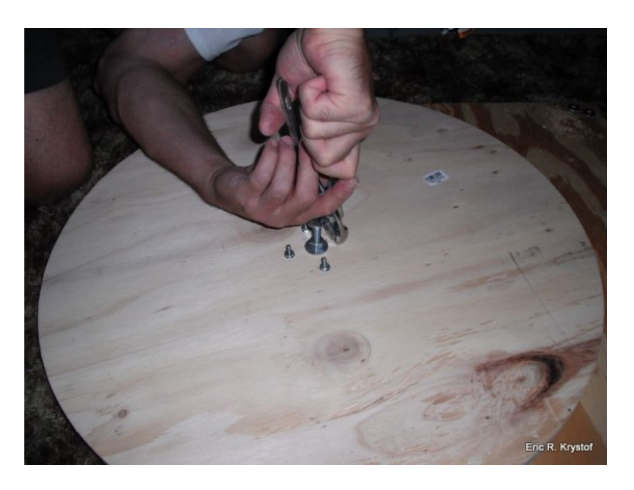
Heli Test Stand Progress

On the side that will be resting on the floor, we secured the foam blocks. In hindsight, I'm thinking we might have used too many, however I do know that our blocks are too thick, which is why we're looking to find a longer bolt, instead of trying to chop down blocks of foam with extreme precision.