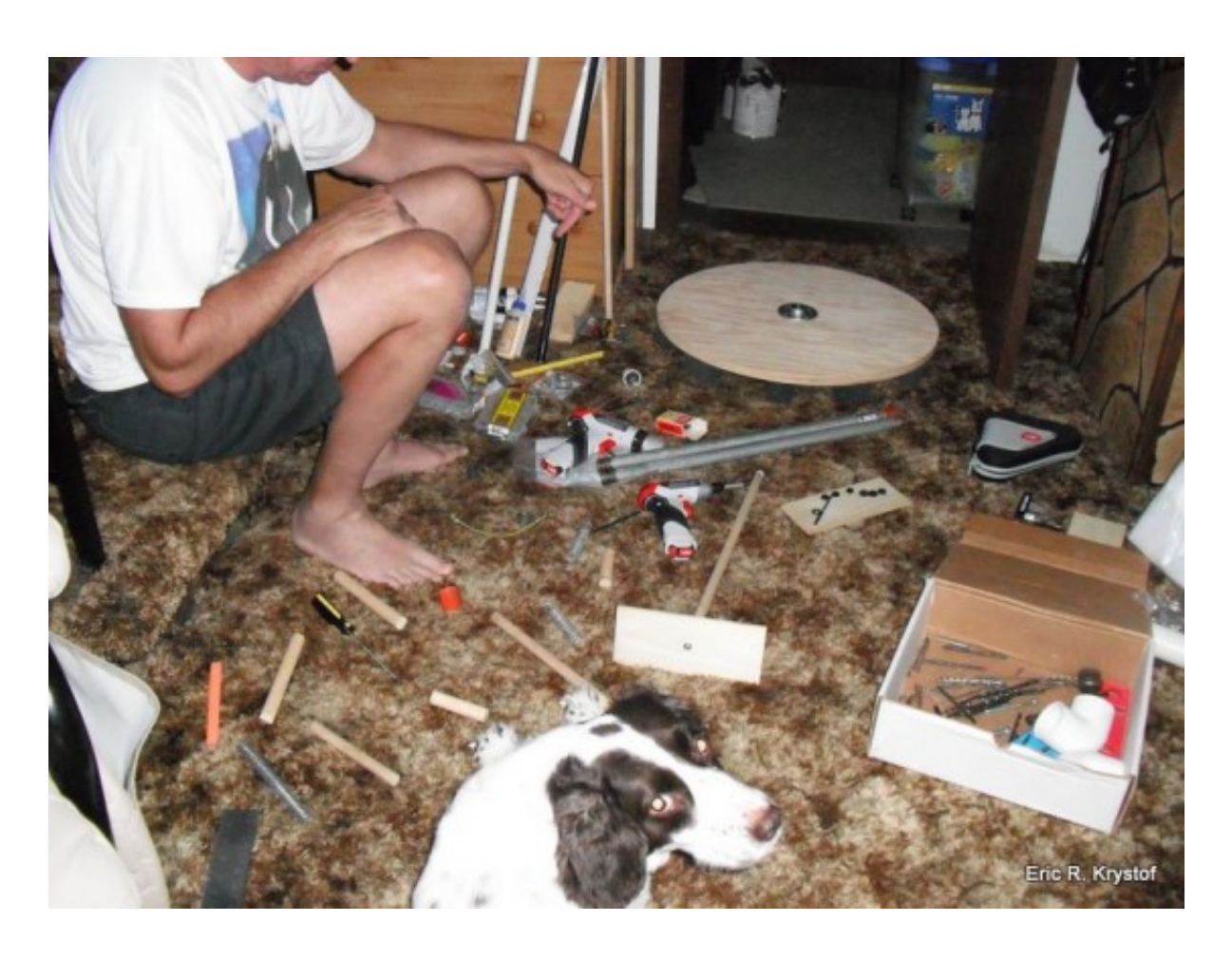
Heli Test Stand Progress

NightFlyyer uses a bungee cord to attach the dowel to the pipe. We followed the same pattern, but Pops is working on some variations to this, such as a stopper inside the pipe instead of using a bungee cord, which would help for any rotation-related movement testing.