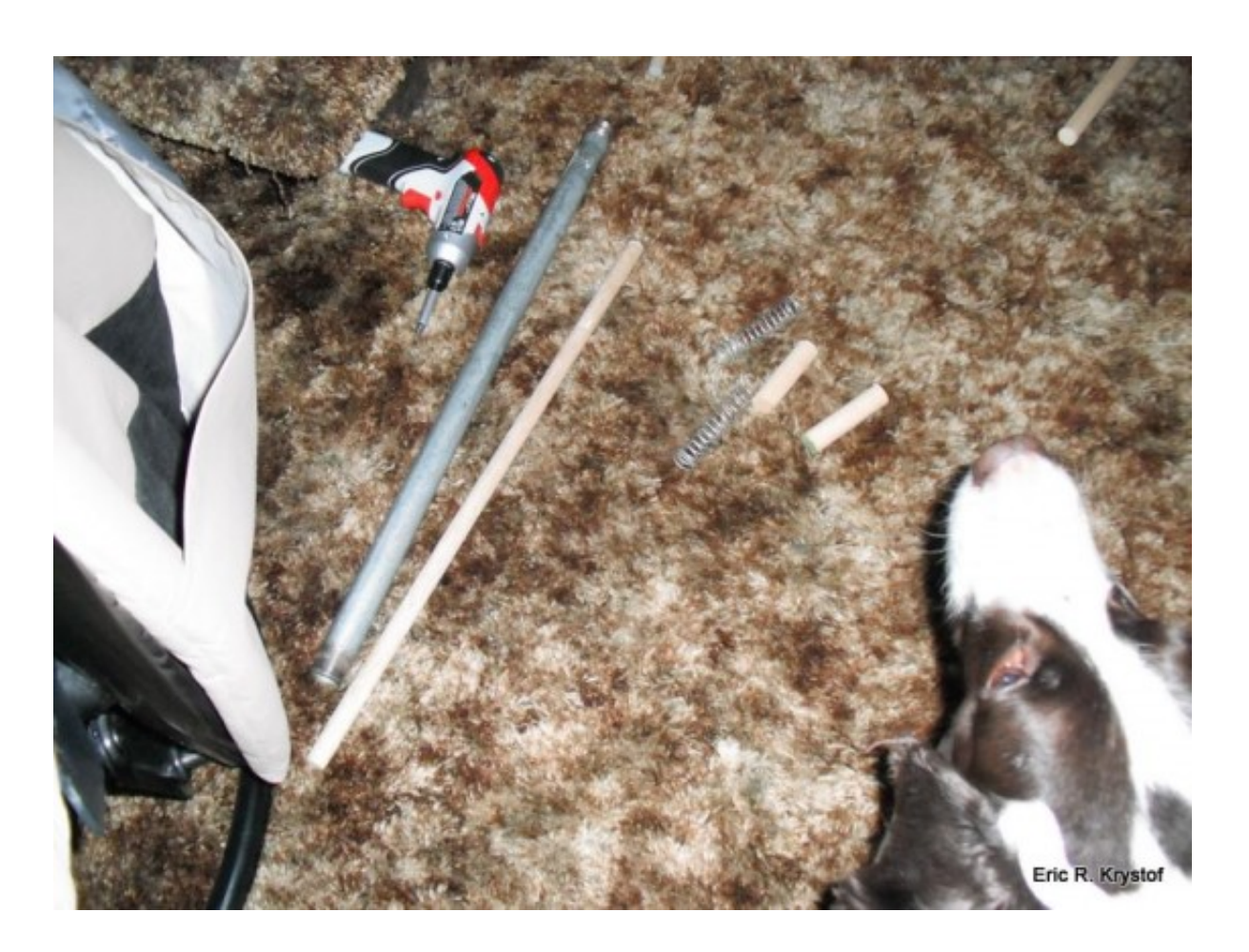
Heli Test Stand Progress