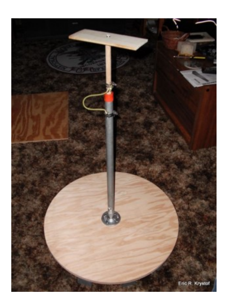
Heli Test Stand Progress

Drilling into the dowels was a bit cumbersome, Pop was afraid the wood would split, so a bit of extra care was taken for that step. Similar to the reference design, but with an added washer to smooth out the intentional tilt of the mounting plate: