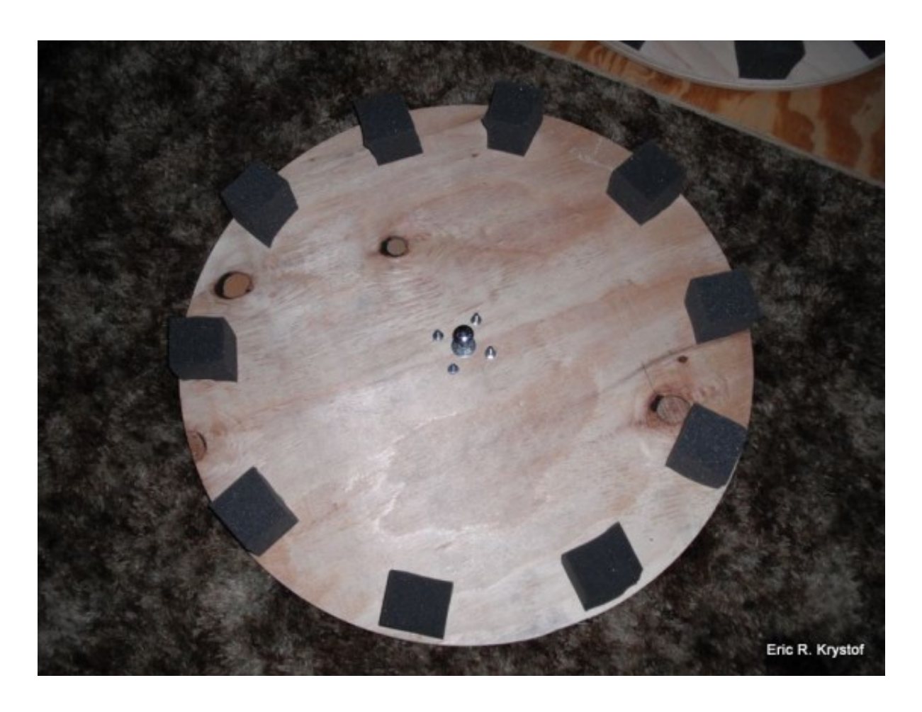
Heli Test Stand Progress

Creating the sliding dowel mechanism that inserts into the spring-loaded pipe: