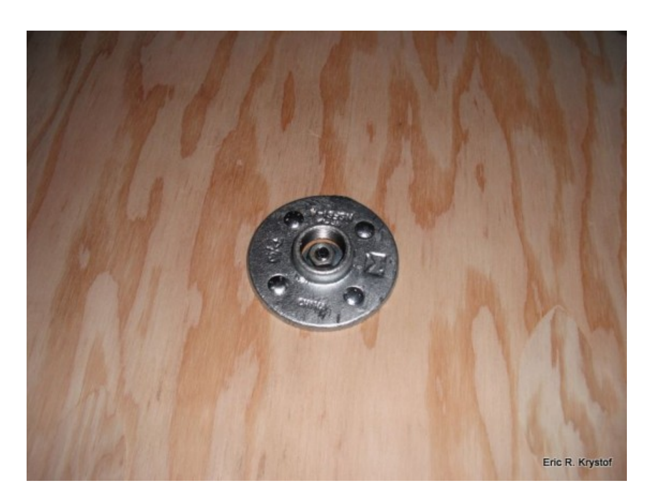
Heli Test Stand Progress