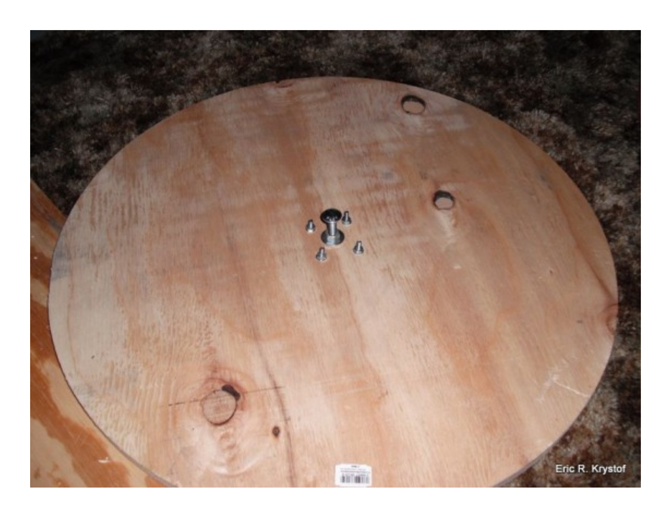
Heli Test Stand Progress