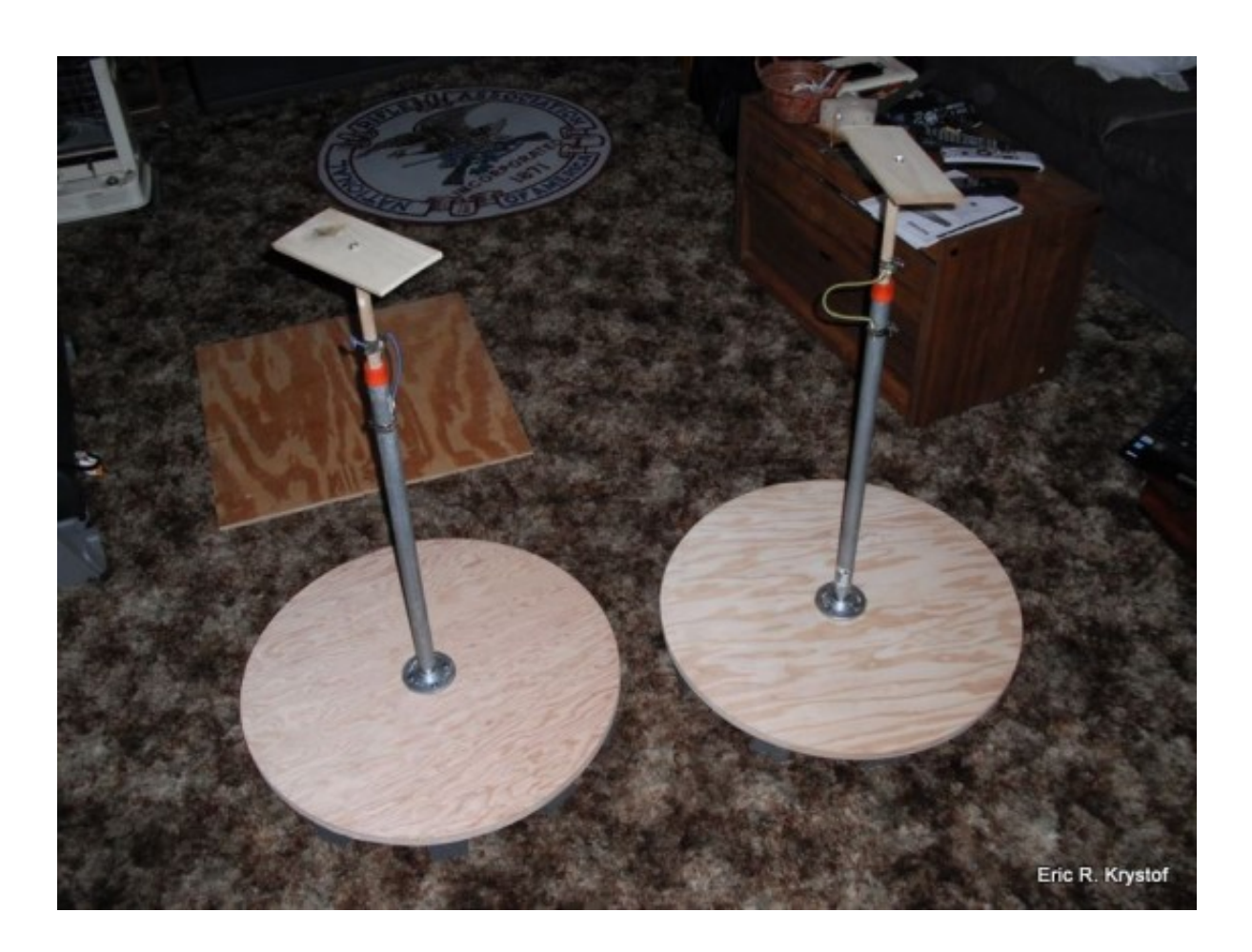
Heli Test Stand Progress