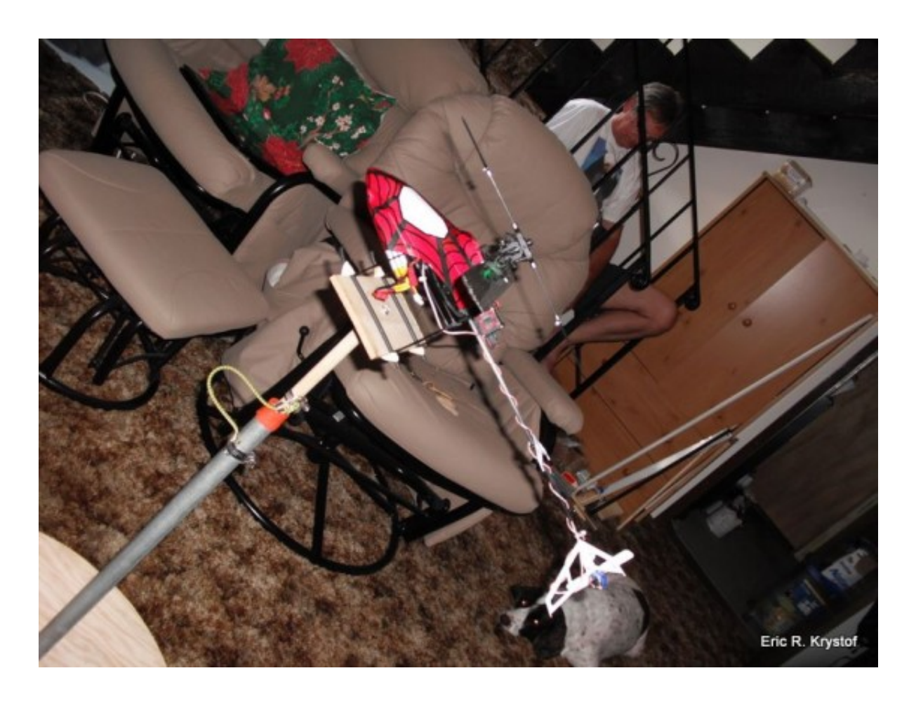
Heli Test Stand Progress